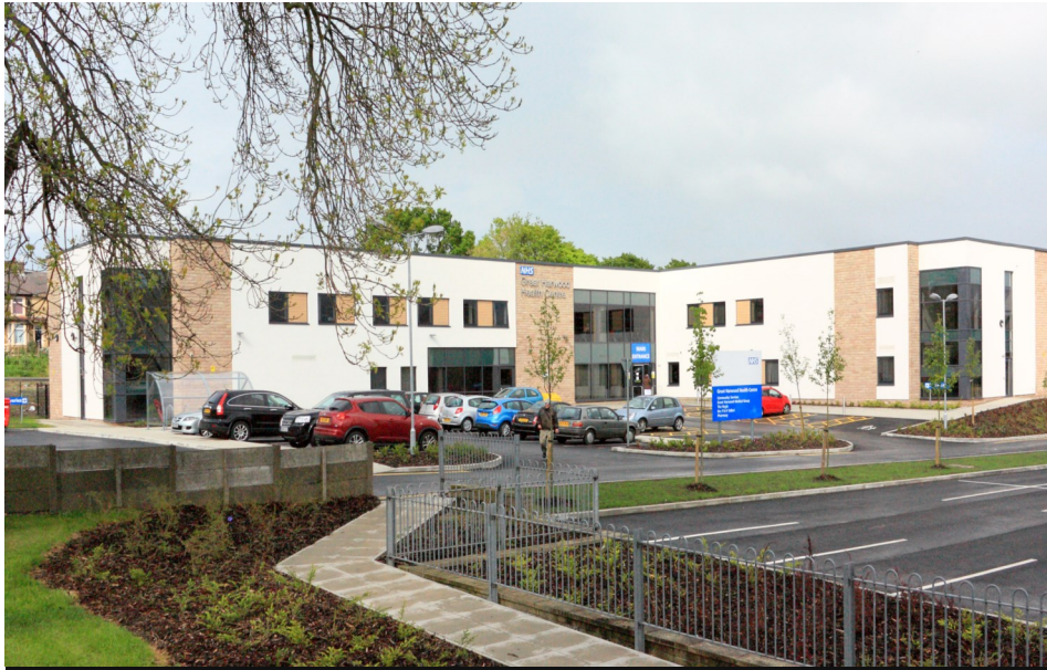
Great Harwood Health Centre